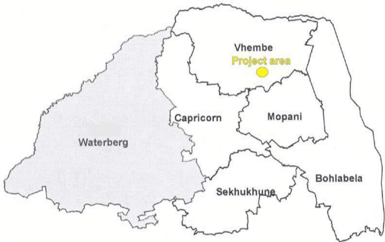
Figure 3.1: Map of Vhembe District Municipality (google.com)