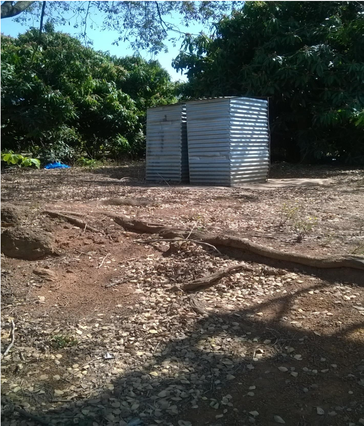
Figure 4.1: Tin toilets (Photographed with management permission)

The images below affirm the above mentioned observations by the researcher.