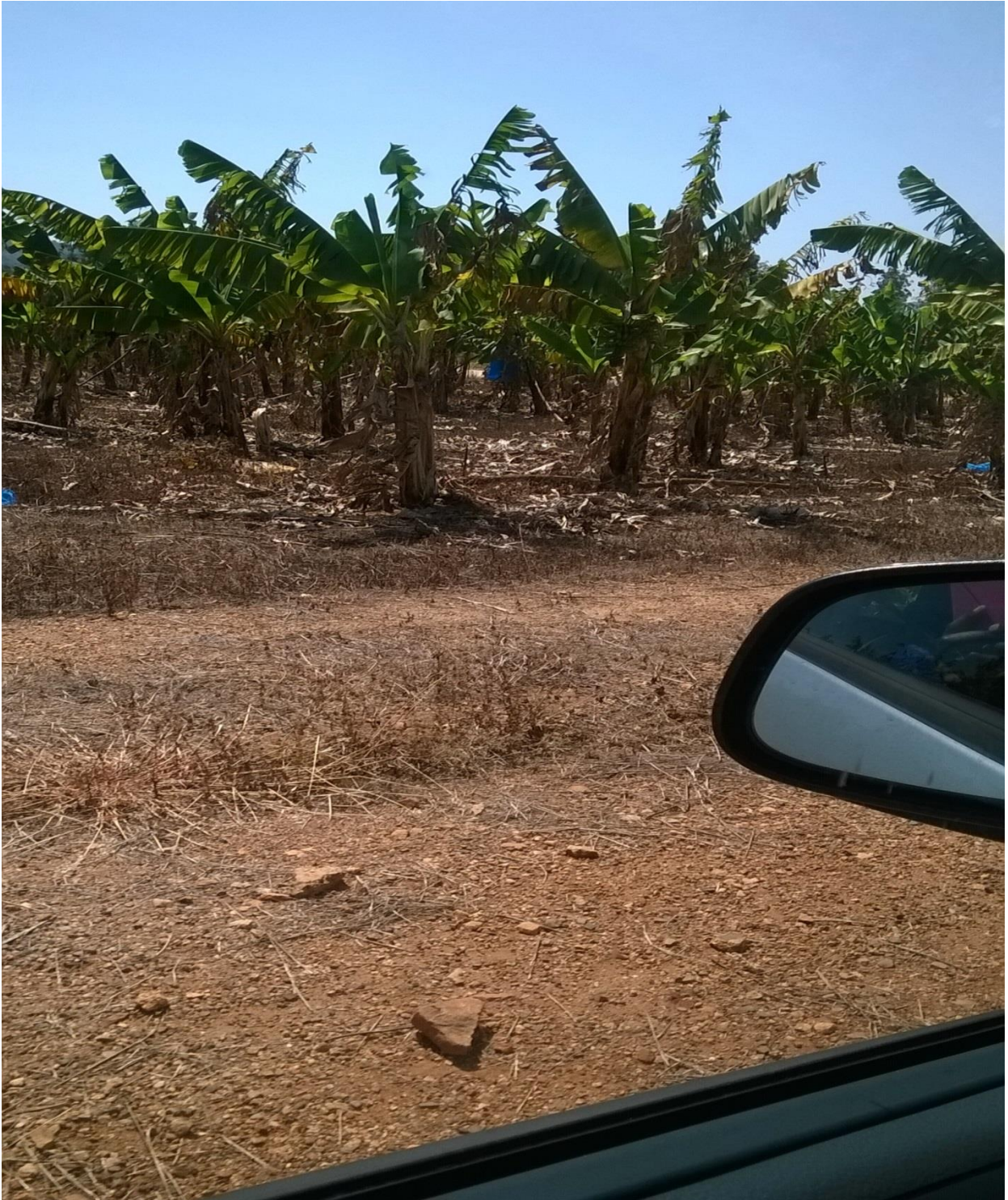
Figure 4.2: Banana plantation (Photographed with permission)