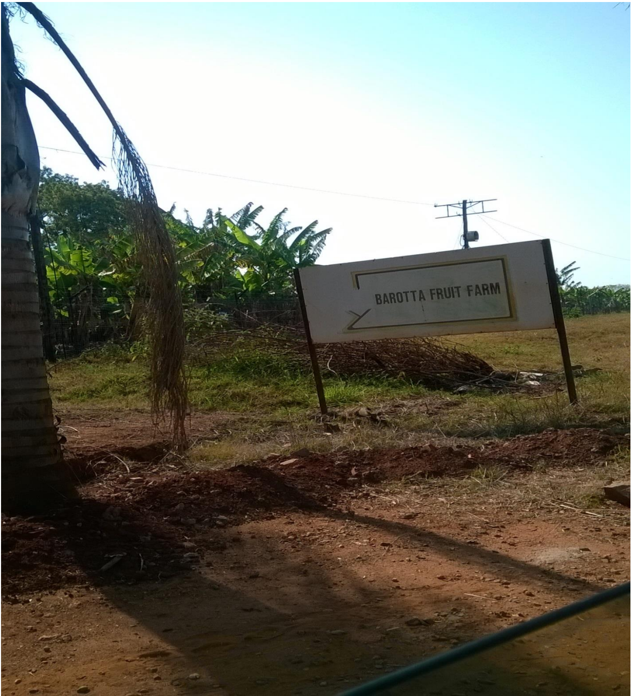
Figure 4.3: Farm signage (Photographed with permission of farm manager)