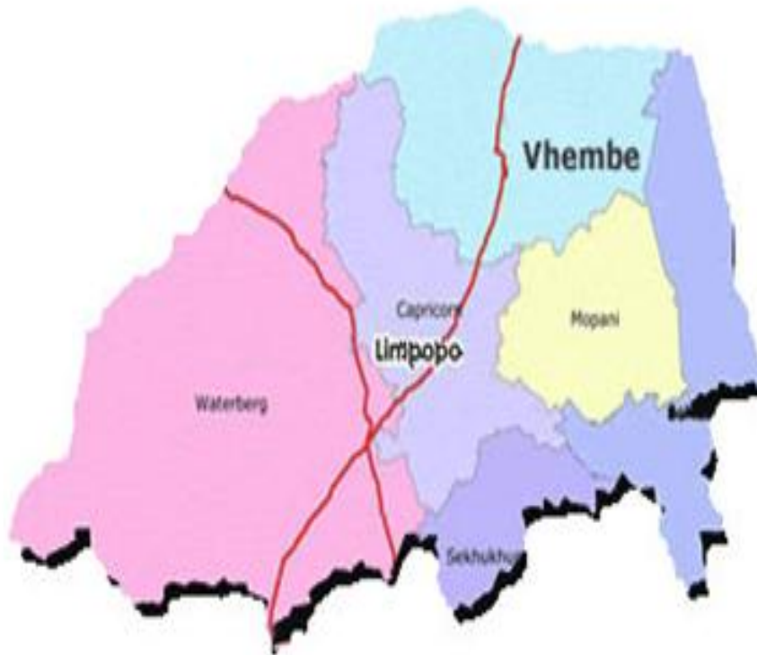
Figure 4.1 Limpopo province showing Vhembe district

I chose three schools with two Grade 3 classes each, which gave a total of six teachers who participated in the study. The reason was to ensure that the data generated by such a number of participants would be manageable given the limited time in which I had to conduct the research (Mugo, 2006). I selected three government schools situated within 10 to 15 kilometres of each other.