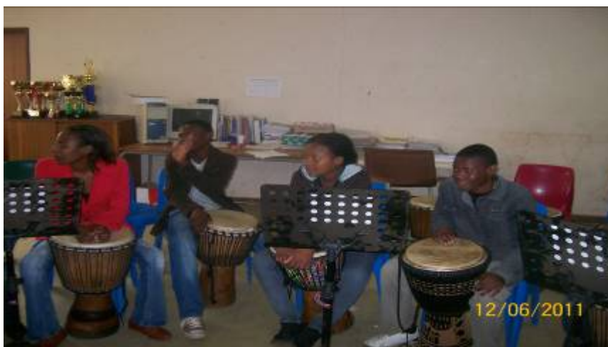
Music learners engaging in group discussion

Years of training: No prior formal music training, except what they receive in school (Music as a subject).