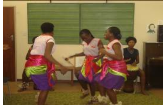
Female traditional musical arts performance