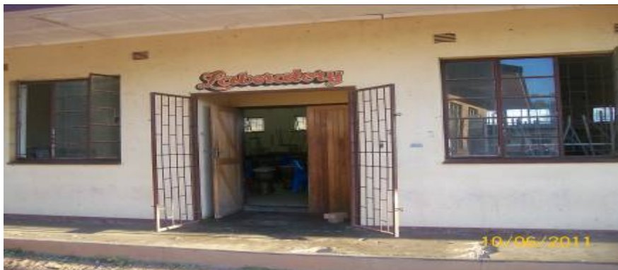
Old science laboratory which is now used as a Music centre in Chayaza High School