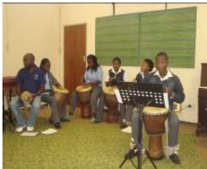
Notated ensemble performance piece