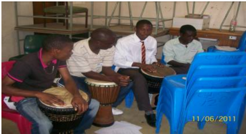
Four participants sharing a music stand made out of piled-up chairs

Since accommodation and catering were not provided, the initial allocated time for the workshop was compromised because participants had to travel to the nearby shops during lunch breaks and some had to leave earlier because of the lack of regular public transport. Because of the abovementioned facts, the workshops started late, resumed late and often ended earlier than initially scheduled. Some of the participants could only come for one day due to financial implications (for accommodation and travelling costs).