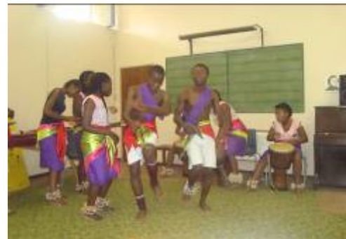
Male traditional musical arts performance