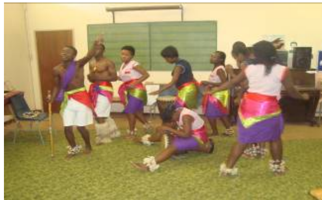
Traditional ensemble musical arts performance