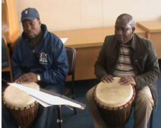
Music teachers practising MACD drumming exercises