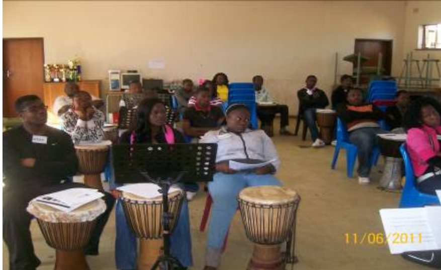
Participants listening to a theoretical lecture on MACD practice

Females : 11 Teachers : 12 Learners : 19 Total numbers : 31