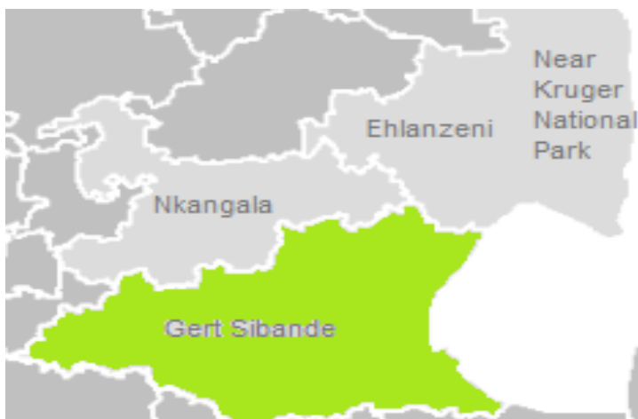
Figure 1.2 Map of Gert Sibande Region