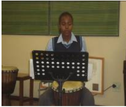
Notated solo piece performance