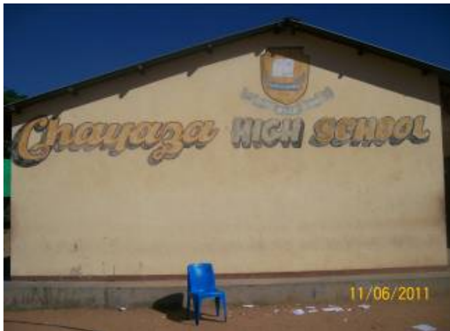
Chayaza High School (Bushbuckridge, Mkhuhlu)