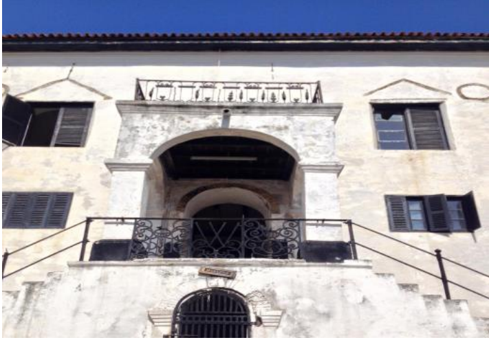
Elmina Castle, Ghana