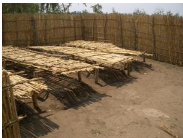
Figure 9: Nursery roof for seedling

After seeds are sown, dried grass should be placed on top of the raised beds or containers to avoid water loss and damage from watering. When the seeds have germinated, a shade “roof” should be constructed to protect the seedlings for a few weeks. The “roof” should be approximately 70 cm high. The roof should be removed to expose the seedlings to full sun in the weeks before transplanting.