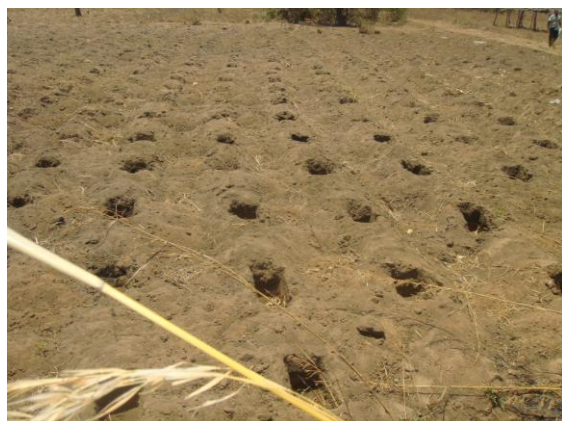
Figure 4: Land preparation for permanent planting basins

Adapted from a guide to Conservation Agriculture in Zimbabwe (2009) and Sasakawa Global 2000