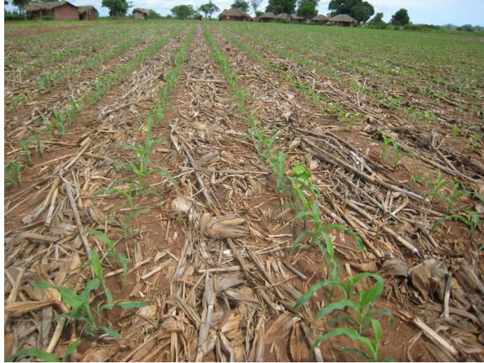
Figure 3: Maize field under “old ridge” tillage or flat tillage in Nkhota kota under MACC project of TLC in 2009