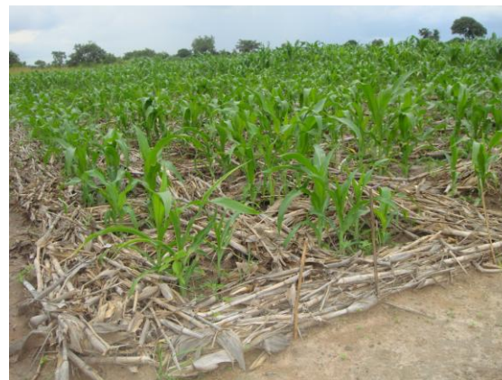
Figure 5: Maize planted in the permanent planting basins