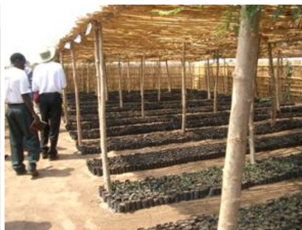
Figure 10: Well managed nursery with a shed.

Water the nursery once in the morning and once in the evening everyday until germination. After germination, watering should be reduced to once a day, depending on local weather and soil conditions. Inadequate or excess water will slow the development of the seedlings, and will hamper field establishment. Seeds and seedlings should be protected from water damage by applying water slowly through grass, a gentle watering can or a plastic bag with small holes.