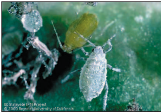
Cabbage aphid.

The cabbage aphid, Brevicoryne brassicae , is a major pest of cole crops worldwide. It is small (1/8 inch long), dark green, and exudes