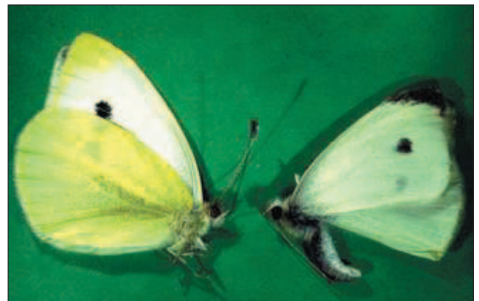
Imported cabbageworm moths.