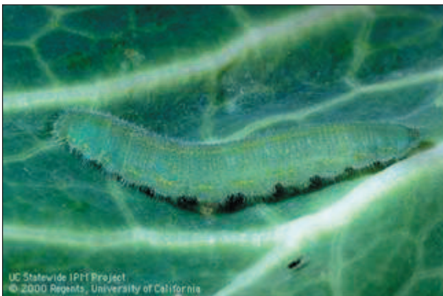
Imported cabbageworm.