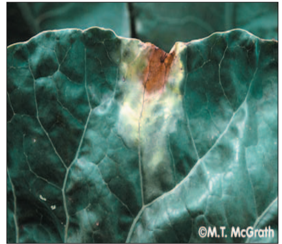
Black rot.

Black rot is caused by the bacterium Xanthomonas campestris . This bacterium favors humid, rainy conditions, and is dispersed by the splashing of droplets of water. Xanthomonas enters the plant at leaf margins or through wounds. Leaf margins develop yellowish patches that turn brown with black veins. The infection works its way down the leaves, leaving a “V” pattern in its wake. The