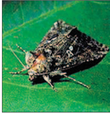
Cabbage looper moth.