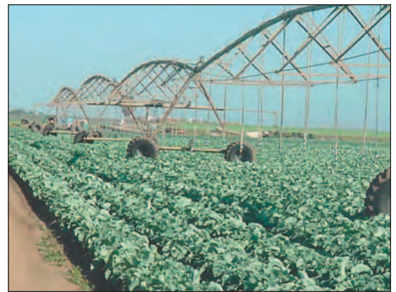
Linear or lateral move irrigation system in broccoli.

Soil texture, environmental conditions, and crop age are factors to consider when irrigating any crop. Cole crops are generally shallow-rooted, with roots ranging from 18 to 24 inches long. Some exceptions to this are mustard, rutabaga, and turnips, whose roots range from 36 to 48 inches. (Doneen and MacGillivray, 1943) Chinese cabbage and pak choi have shallow root systems that respond well to light, frequent irrigations. (Larkcom, 1991) Essentially, the art of irrigation is applying the right amount of