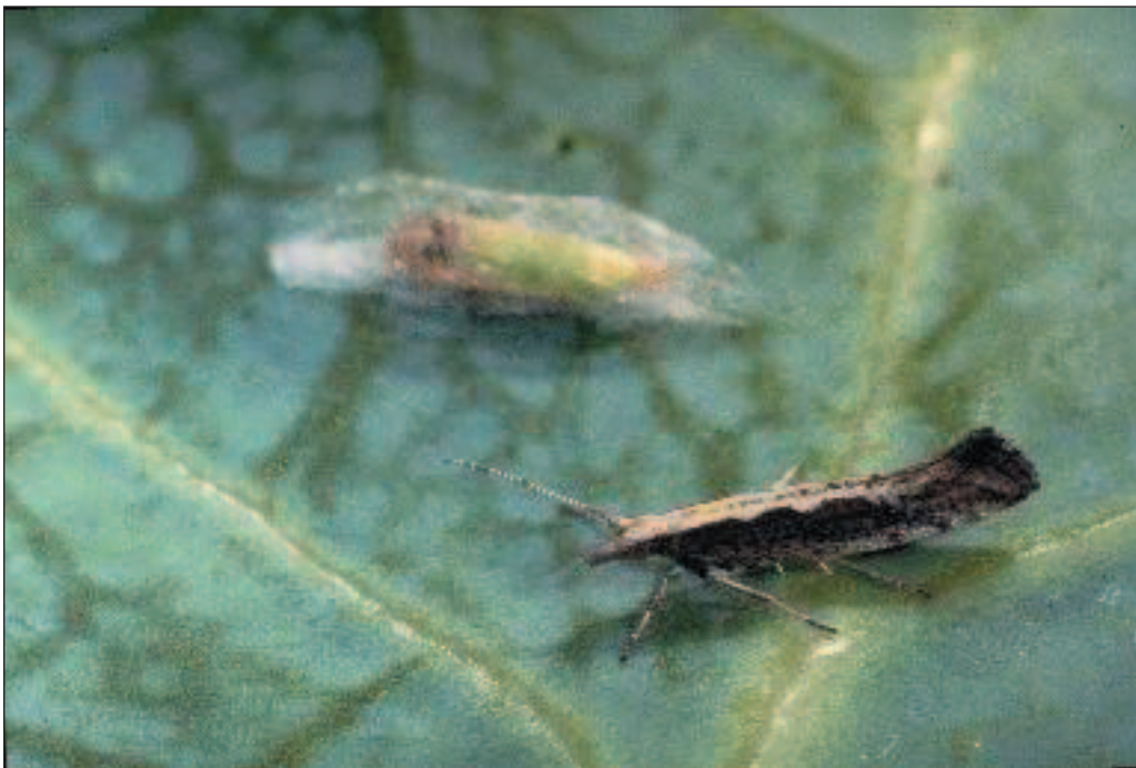
Diamondback pupae and adult.