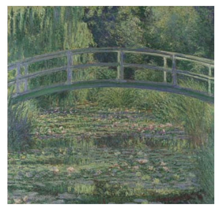
The Water-Lily Pond, Claude-Oscar MONET.

3.5 It is generally recognised that not all heritage assets are capable of valuation. However, where meaningful figures can be produced with the use of existing recognised methodologies, it has been argued that a recognition approach can have positive benefits. IPSASB takes the view that the issue of cost-benefit is important in determining whether a recognition approach should be adopted and such a concern is implicit within the ASB discussion documents, although the ASB proposals do not state an explicit rationale for the proposals.